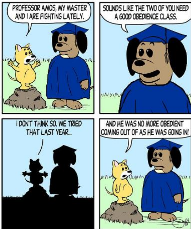
MANY OF US NEED AN "OBEDIENCE TO GOD" CLASS!